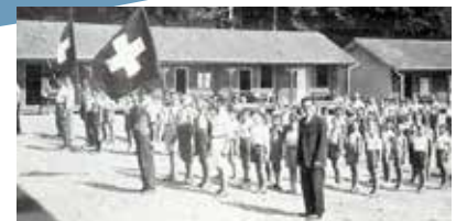
Campsite in Vennes, Switzerland opens, 1934