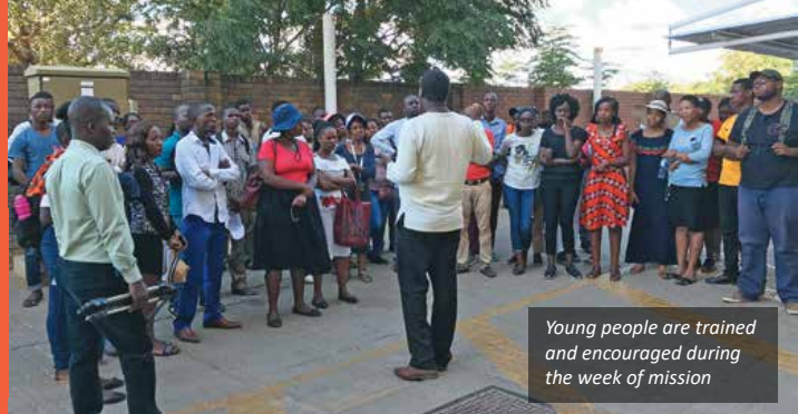
Young people are trained and encouraged during the week of mission