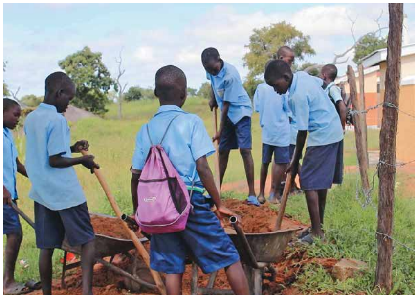
Children and young people at a refugee camp in Northern Uganda where SU is working