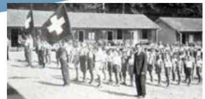
Campsite in Vennes, Switzerland opens, 1934